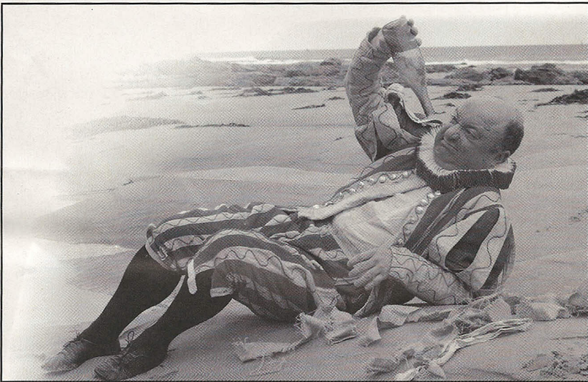
■ Fun and games at Tynemouth.