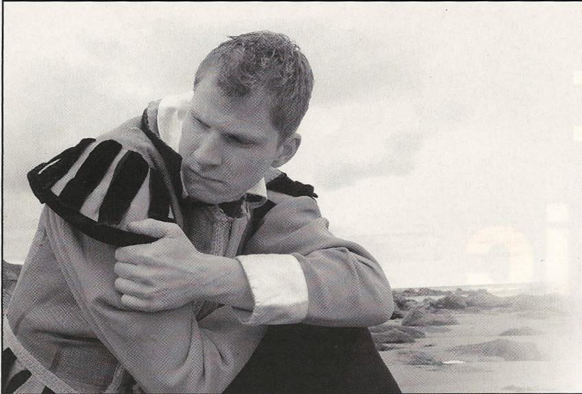
■ The Tempest starts on Monday, July 16.