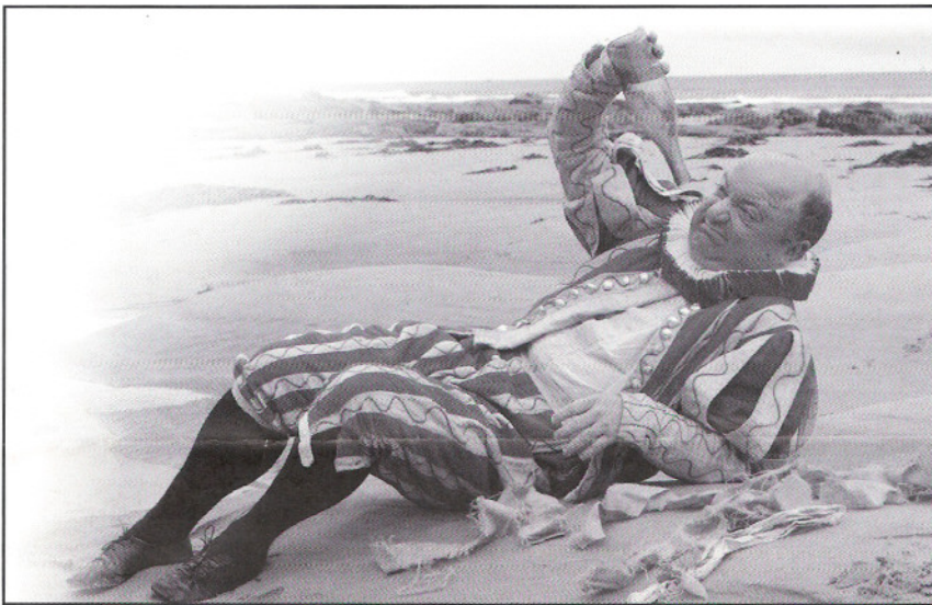
■ Fun and games at Tynemouth.

NEWCASTLE-BASED theatre group 1399's new production The Tempest kicks off next week for a month-long stretch at the picturesque Tynemouth Priory, which will be turned into an open-air stage.