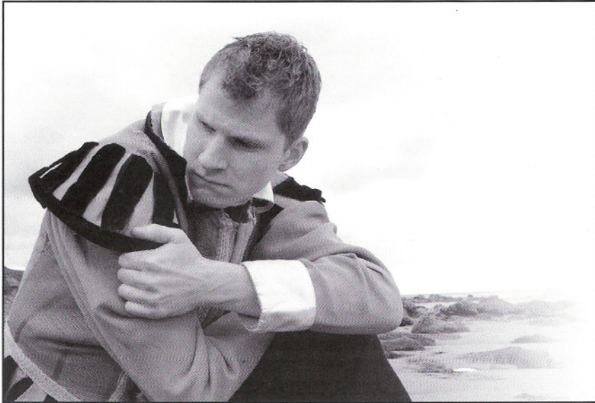
■ The Tempest starts on Monday, July 16.